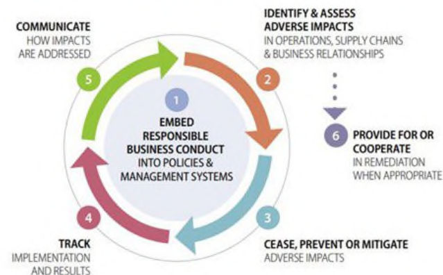
FIGURE 1. DUE DILIGENCE PROCESS & SUPPORTING MEASURES

Figure: OECD (2018) OECD Due Diligence Guidelines for Responsible Business Conduct