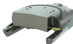
Wireline blind shear